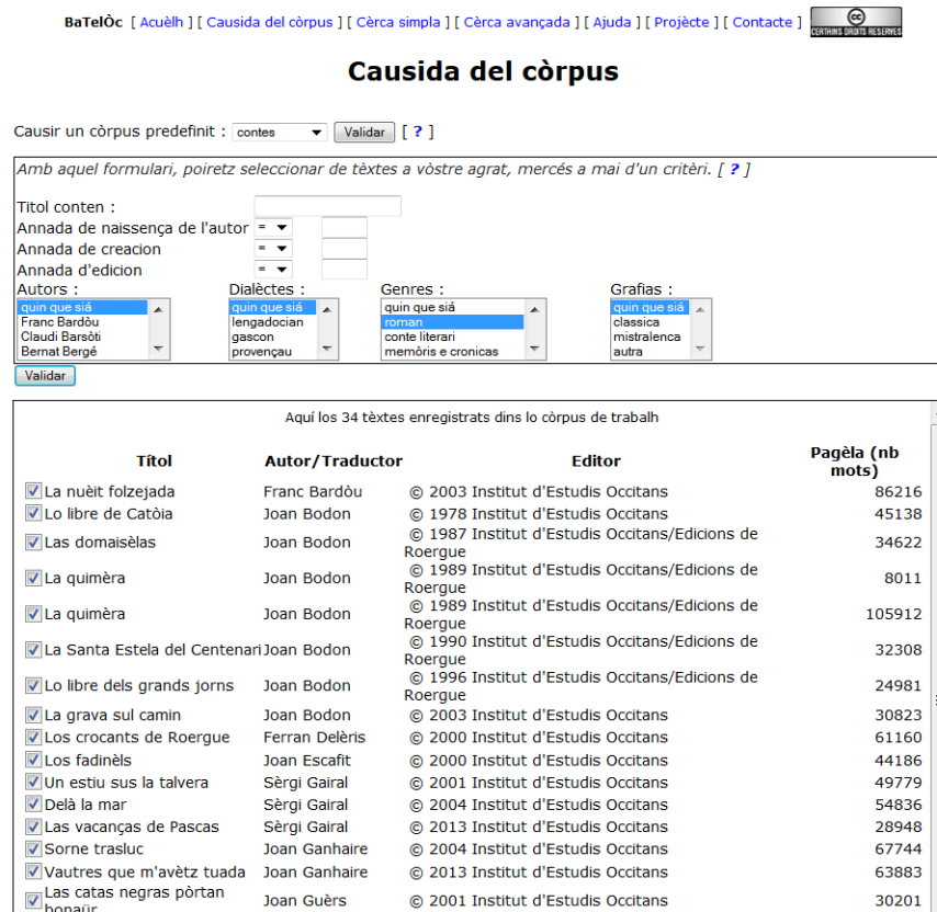
FIGURE 3: Building a corpus of novels

norms. This allows the definition and adaption of the corpus to specific research goals (for instance, a corpus organized according to genre for descriptive linguistic purposes, a corpus organized by time periods in order to study the diachronic evolution of Occitan, a corpus organized by dialects to study diatopic variation or a corpus organized by authors to study diastratic and diaphasic variation). Figure 3 shows an example where all the novels ( roman ) of the text base are selected.