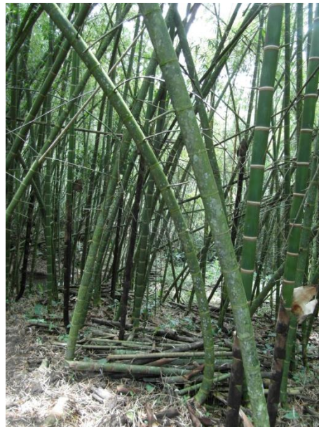
Figure 1: Dendrocalamus asper plantation in Ecuador 5

Worldwide there are around 100 so-called “woody” species suitable for construction. Clumps (a group of culms growing together) of the larger woody species normally reach peak production after about seven years and can maintain regular cropping of around 20-25% throughout their productive lifecycle. Figure 1 shows a bamboo plantation in Ecuador.