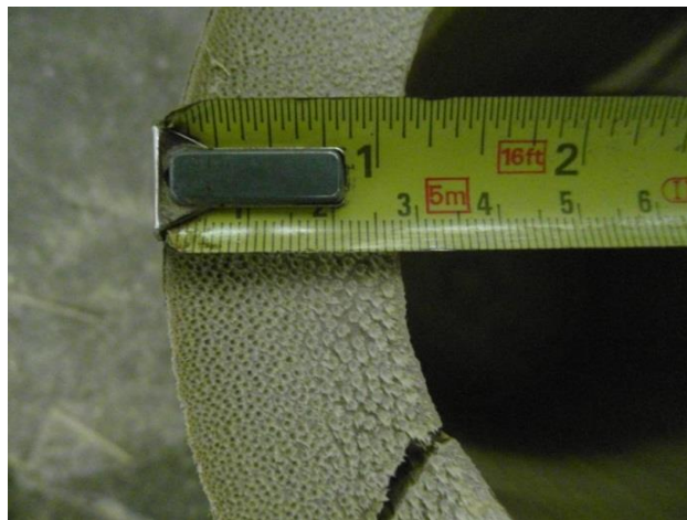
Figure 3: Section through the culm wall showing variation in fibre density 5

Amongst non-engineers, it is a common misconception that bamboo is “as strong as steel” (see Technical Note 3). In fact, some of the stronger bamboo species possess strength properties similar to high grade (e.g. D40) hardwood, except in tension perpendicular to fibre where it is weaker. Bamboo generally has very good parallel-to-fibre structural properties, with allowable stresses in bending, tension and compression all around 15\text{N/mm}^2 for one of the main species of bamboo used structurally called Guadua angustifolia Kunth 2 , and a wider range of between 10-20 for most species of bamboo 6 . Allowable shear stresses are relatively low at around 1.2\text{N/mm}^2 , which is further accentuated by bamboo’s tendency to split 7 due to the weak parenchyma matrix and the typically thin section walls – suggested characteristic tensile strengths perpendicular to the fibre are as low as 0.46\text{N/mm}^2 8 . Because of these