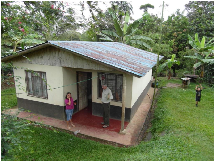
Figures 7 and 8: Low-cost bamboo housing in Costa Rica, part of the National Bamboo Project 5