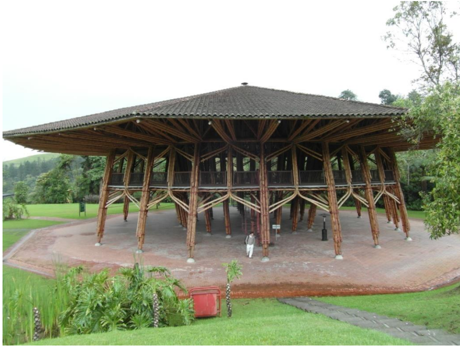
Figure 4: Prototype of ZERI bamboo pavilion used in the EXPO 2000 in Hannover, Colombia, by Simon Velez. Bamboo is Guadua 5