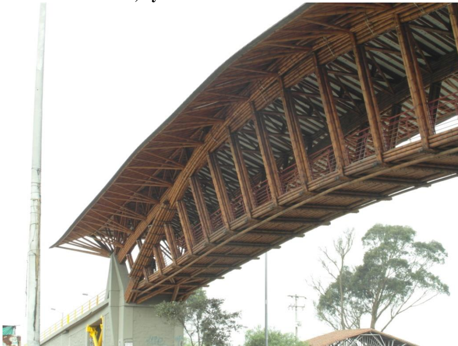
Figure 5 and 6: Jenny Garzon Bridge, Colombia, by Simon Velez. Bamboo is guadua 5