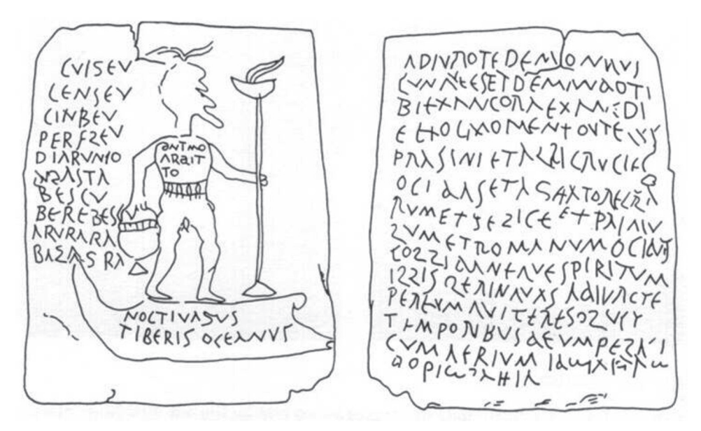
Picture 2. Facsimile of the tablet dfx 11.2.1/22 from Hadrumetum, AUDOLLENT (n. 13) DT 286

On side A of the tablet, a long-bearded anthropomorphic daemon is depicted standing on a ship, holding an urn (?) in his right hand and a torch in his left hand. To the left of him, there are ten magical words written in a column: Cuigeu, Censeu, Cinbeu, Perfleu, Diarunco, Deasta, Bescu, Berbescu, Arurara, Baζagra ; one more word is inscribed on the chest of the daemon: Antmoaraitto . The names of cursed hoses are inscribed on the depiction of the ship the daemon stands on: Noctivagus, Tiberis, Oceanus . The text of the curse itself is written on side B of the tablet. Agonistic texts represent (nearly 20% of all texts we have)<sup>17</sup> in the preserved Latin curse documentation. All have been found in Africa and were often batch manufactured in local magical "workshops". These include many "magical" features ( voces magicae, signa magica , see below) and date mostly to the 2<sup>nd</sup> or 3<sup>rd</sup> cent. CE. Although it can be presumed that this kind of curses was used in all regions of the Roman Empire where the circenses took place, only other types of curses have been found so far in other European amphitheatres; besides, agonistic spells from Rome written in Greek have been preserved.