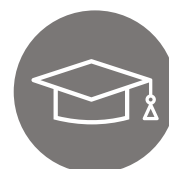
Lessons learnt from the Covid-19 pandemic