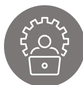
Smart and modern administration