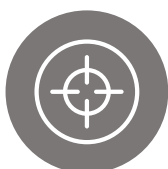
Focused policy support

The aim of that programme is to refocus management on boosting the CoR’s impact and performance through the following clusters: