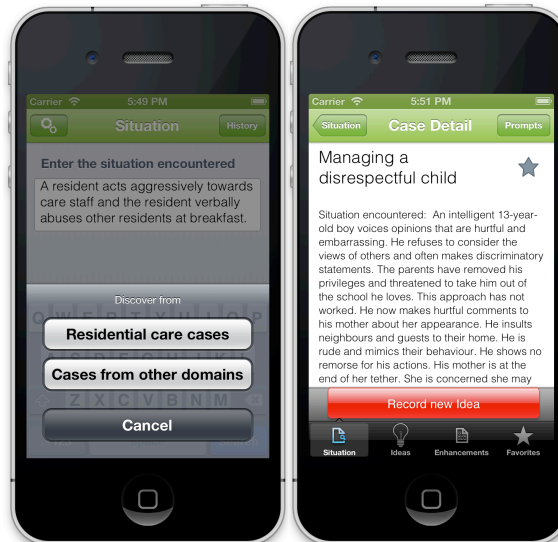
Figure 1. The Carer mobile app showing how carers describe challenging behaviors (on the left-hand side) and a detailed description of one of these cases (on the right-hand side)

The Carer app accesses a digital repository to retrieve natural language descriptions of cases of good care practice in XML based on the structure of dementia care case studies reported by the Social Care Institute for Excellence (Owen and Meyer 2009) as well as challenging behavior cases in non-care domains such as teen parenting, student mentoring and prison life . Each case has two main parts of up to 150 words of prose each – the situation encountered and the care plan enhancement applied – and is attributed to one class of domain to which the case belongs. The current version of the repository contains 115 case descriptions.