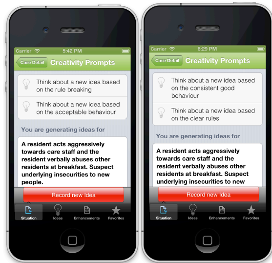
Figure 5. The Carer mobile app showing creativity prompts generated for the Managing a disrespectful child case

sented in the Carer mobile app while Figure 6 lists all creativity prompts that the service generates for the analogical case.