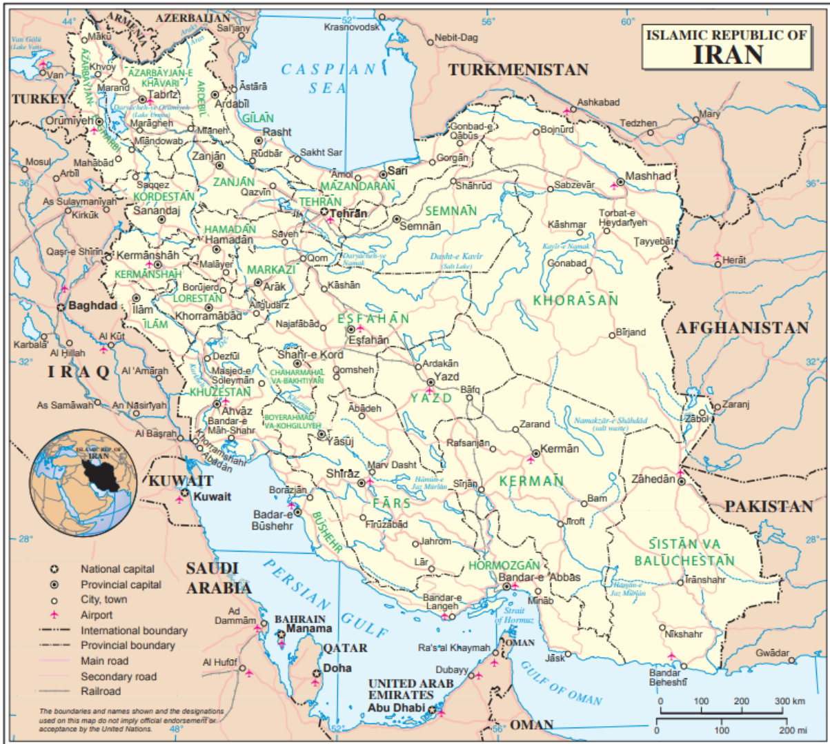
Map 1: Iran (Islamic Republic of), © United Nations. 4