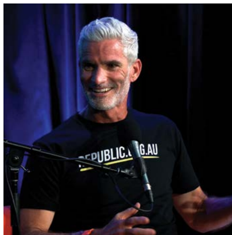
Craig Foster, chair of the Australian Republic Movement, discusses Australia's future with the monarchy.