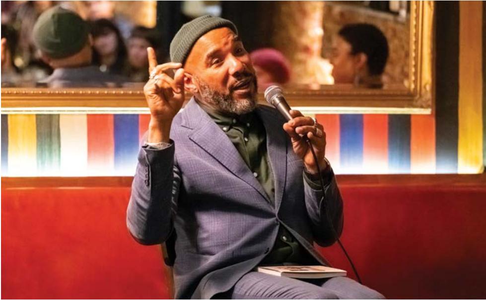
Poet, novelist, academic, musician and winner of this year's TS Eliot Prize for Poetry, Anthony Joseph.