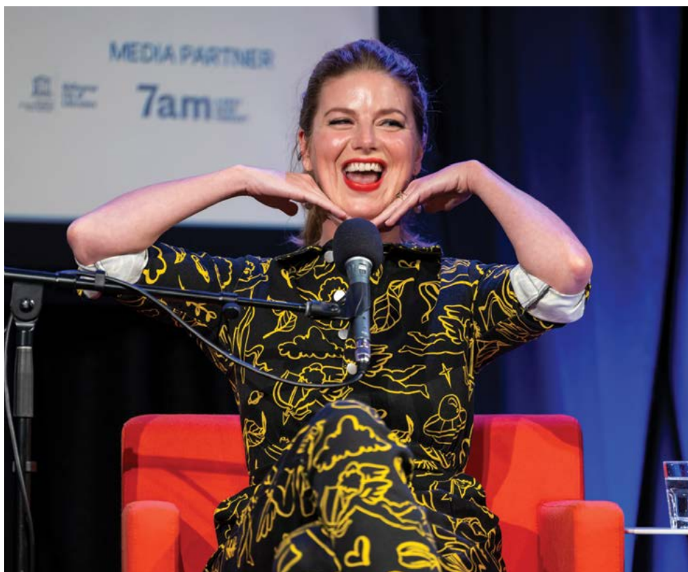
Podcast sensation Caroline O'Donoghue records a special episode of Sentimental Garbage live in Melbourne.