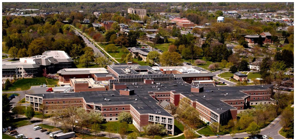
James H. Quillen VA Medical Center

The medical center currently uses UDAS to capture data from fetal monitors, incubators, ventilators, physiological and cardiac output monitors and other connectable bedside devices in labor and delivery (L&D), the neonatal intensive care unit (NICU), and the intensive care unit (ICU).