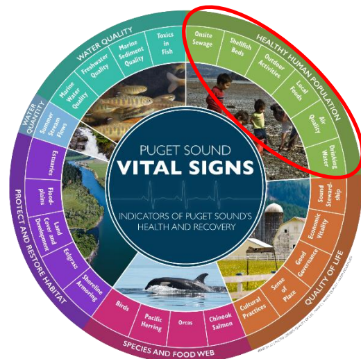
Figure 1: Puget Sound goals and associated Vital Signs. The Healthy Human Population Goal and associated Vital Signs are circled in red.

Each Vital Sign is represented by one or more indicators, which are designed to be specific and measurable. For example, the Local Foods Vital Sign has two indicators: Locally Harvestable Foods; and Recreational Shellfish Beds. Some Vital Signs do not have a specific Indicator established yet.