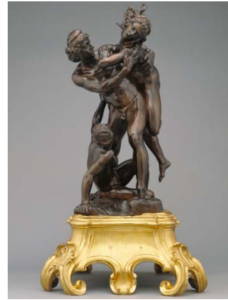
The Abduction of Helen

https://commons.wikimedia.org/wiki/File:François-Xavier_Fabre_-_The_Judgment_of_Paris.jpg