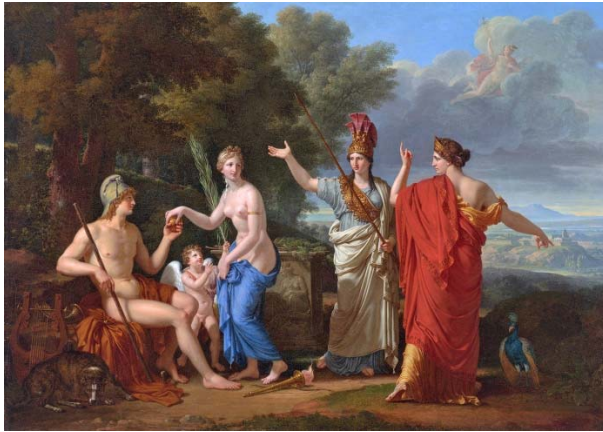
The Judgment of Paris