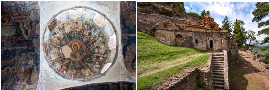
(left) Dome fresco (right) Perivleptos Monastery at Mystras.

In Byzantine times, Sparta declined during the growth of Mystras, a nearby fortified town. In late 1248 AD, William II of Villehardouin, a Frankish successor of those who had conquered and controlled Achaia (north-west part of Peloponnese, around the area of Patras) during the fourth Crusade, captured Monemvasia, the last remaining Byzantine outpost on the Morea (the name of the Peloponnese during the middle-ages). The young prince examined the area of Lakonia during the winter of 1248–49, touring the countryside and selecting sites for fortification, and finally he built the fortress that came to be known as Mystras, near ancient Sparta. After a century of conflicts between the Franks and Byzantines, until its surrender to the Ottoman Turks in 1460, Mystras became the residence of a 'Despot' (Christian religious leader) in 1348. The Despot ruled over the Byzantine Morea, and the region became known as the "Despotate of the Morea". This was the city's golden age: according to the Oxford Dictionary of Byzantium , Mystras "witnessed a remarkable cultural renaissance, including the teaching of Plethon, and attracted artists and architects of the highest quality".