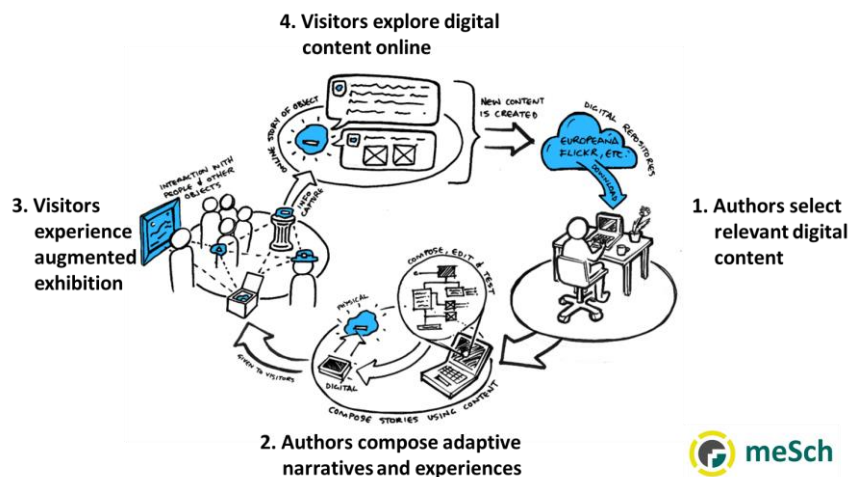
Fig. 1. The meSch production cycle for personalized experiences in a cultural space.

In meSch we envisage a cultural space filled with smart objects, each with their own (adaptive) stories embedded therein, that will be revealed if and when conditions are right, e.g. visitors have reached the right time in the storyline, or a group of them is acting in a certain way, or another smart object is close by. The role of curators and exhibition artists is fundamental in conceiving the very first idea of the intended educational/experiential mission of the exhibition, in selecting the most meaningful and evocative objects, in imagining alternative threads of narration, in deciding when and how digital information should be unlocked. Fig. 1 illustrates the overall production cycle for personalized experiences.