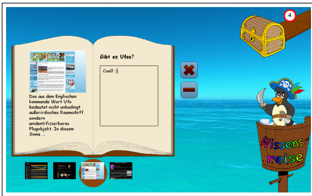
Figure 5: Screenshot of the user interface: journey journal with favourite web pages.

“-”-Button. Tiles in the form of small website thumbnail (below the journal) are used to navigate within the book.