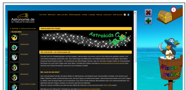
Figure 4: Screenshot of the UI: website opens in a frame.

A child can store relevant results in the “treasure chest”. This form of storage aims to support children’s memory to prevent cognitive overload. The number of stored results is shown near the chest. Furthermore, we use physical concepts like the size of the chest to show the amount of “treasure”, i.e. a chest icon becomes larger with each additional stored result (compare Fig. 1 and 5). By clicking on the chest, a journey journal opens (Fig. 5). We use a book metaphor, where each reversal of the book contains information about a stored webpage: its thumbnail, a textual summary and a title. A child can add notes to each website. It can also open the website again by clicking on its picture in the book. If a child does not like a website anymore, it can delete it by clicking on the