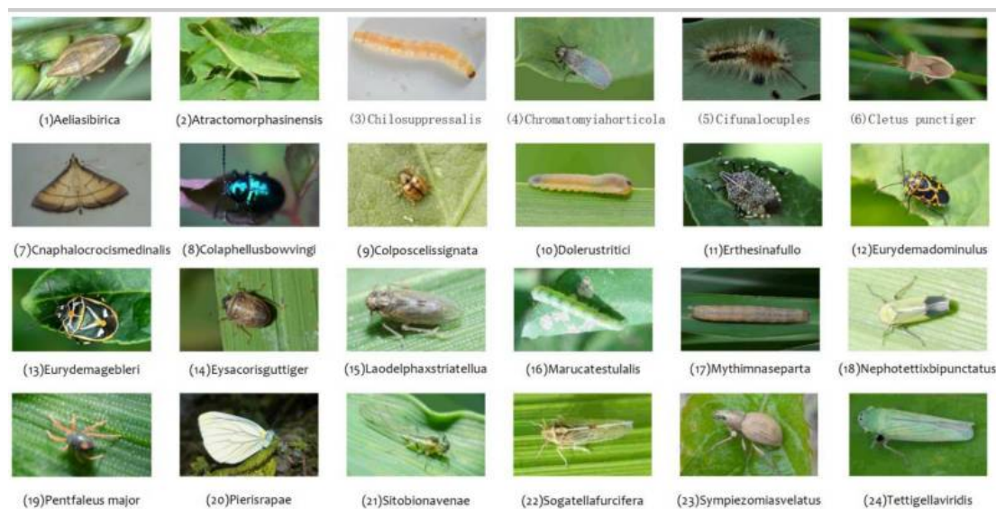
Figure 1: Different pest damaging the crops [11]

technique and machine learning algorithm in disease and pest detection is an active field for research that shows immense potential to address the problem of early and accurate pest and disease detection in the crops. Various types of pests are shown in figure [1]. Plant diseases visibly show a variety of shapes, forms, colors [6]. Continuous monitoring is necessary for early pest and disease detection to prevent the pest spread in entire crops. Early identification of pest and disease in plant is a key point for crop management but this is time consuming, costly and inefficient using traditional techniques [3]. Moreover, lab equipment is too costly and lab test are destructive because lab test needs more sample to test the plants. So, getting rid of these problem automated image processing techniques for pest and disease detection in crops are used.