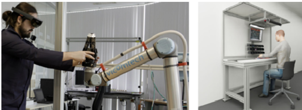
Figure 2: Examples for XR with voice recognition

XR with voice recognition scenarios showcase example of BCC. [23] proposes a system for operators to carry out a certain task through the combination of XR technologies with voice interaction process control logic ( Figure 2 ). The proposed work streamlines multiple input and output XR devices into the logical scheme of a voice recognition system, describing and validating a framework enhancing human-machine communication interfaces. The authors showcase two examples empowering operators. The first one focuses on an operator maintaining the gripper of a Universal Robot using HoloLens Glasses. As this operation requires the simultaneous use of both hands, voice based interaction suits its requirements. The second example focuses on the assembling of cables for electric panels with an Augmented Reality system combining different uses of the projections and voice-based responses. Moreover, aural responses are also projected for operators with hearing impairments.