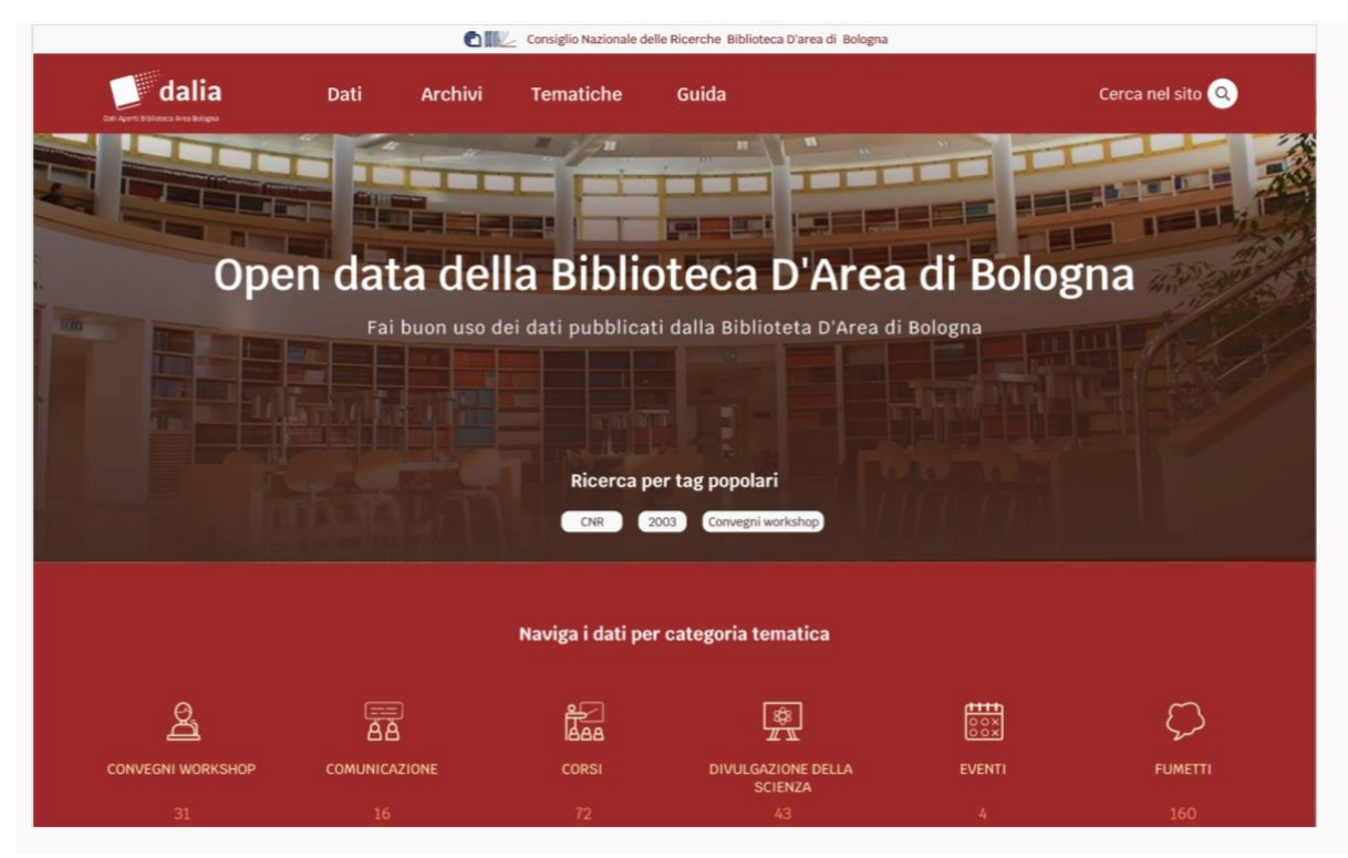
Figure 2: DALIA web-interface (prototype).