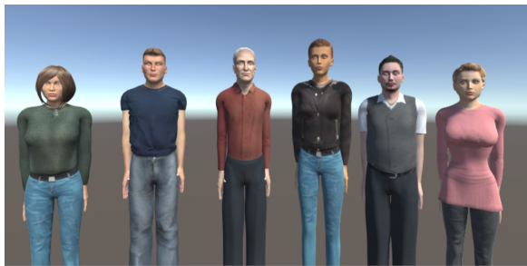
Figure 2: Embodied conversational coach archetypes.

The main contribution of this research work will be, to develop a multi-party conversation model that will facilitate turn-taking in a dyad or multi-party scenario that involves human user and virtual agents. The interaction will allow both reactive and proactive user participation and the speaking turns will be driven either by the users or the agents to ensure mixed initiative. The model will also be able to handle interruptions and manage dynamic group conversations in a multiparty scenario based on the role and domain of expertise. Further, we aim to maintain user’s engagement by, gathering data on user’s emotional state, providing information to the user appropriately, and ensuring that the user maintains involvement in the interactions with the coaches. This work will make use of and build upon the GRETA/VIB platform [25] for multimodal behaviour generation and for visualizing virtual coaches.