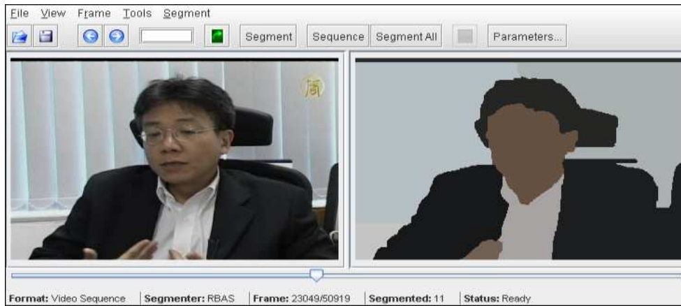
Fig. 1. Screenshot of the Application User Interface

Segmentation: Developers wishing to integrate segmenters must implement the Segmenter interface. This includes all the functions required to configure parameters and perform the segmentation. When a segmenter is implemented and added to the platform, the algorithm name and parameter configuration will appear in the user interface.