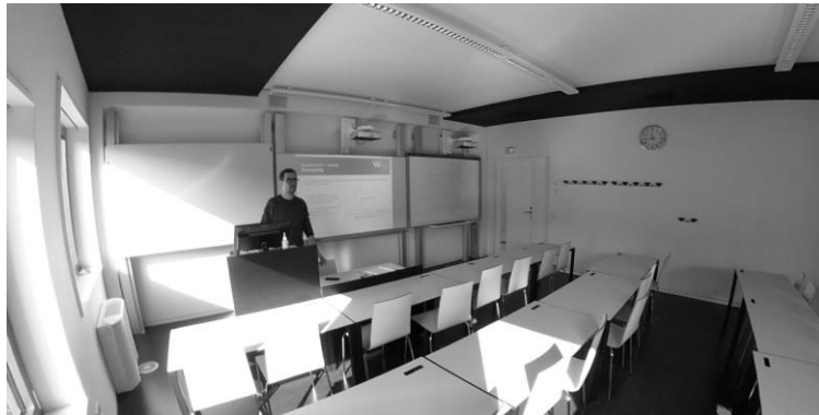
Fig. 2 Camera position at the side, with no readability of slides.

exist, such as proprietary applications from manufacturers, which need to be installed on mobile devices. Lecturers might disapprove of this, as it may interfere with their personal devices. The Ricoh Theta V is controllable via an API over USB through libptp2 5 , a library to control camera functions. For this purpose a prototype has been developed enabling a mobile ad hoc remote control via a web interface in order to explore this challenge. It incorporates a Raspberry Pi, a Wireless LAN USB adapter and a USB cable connected to the Ricoh Theta V. Simple remote control actions such as starting and stopping a recording were tested and confirmed functional via terminal commands. This web interface could replace proprietary applications and offer a flexible way to control and preview the camera via any browser interface.