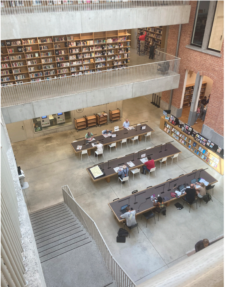
The library is on four floors