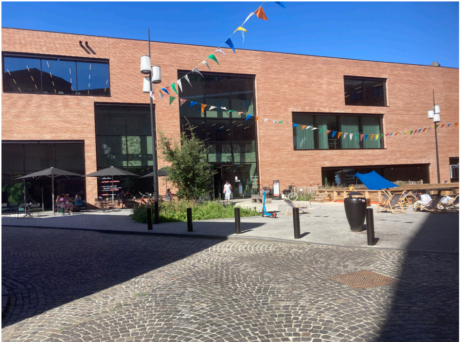
Also in brick is the side

Well worth a diversion if you are in Brussels, Ghent or Antwerp.