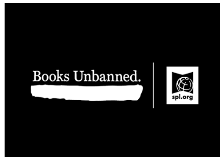
Books Unbanned Logo

While book challenges have increased at an exponential rate across the U.S., some communities have been more affected than others. In New York City and Seattle, our communities have shown strong support for their library systems and appreciation for diverse collections. Across 27 locations of The Seattle Public Library (SPL), only a few requests to remove materials are received each year. While Brooklyn Public Library (BPL) receives regular comments and complaints, the library has only received three formal challenges in the past five years. However, reports from our colleagues in the profession indicated that there are many pockets of the country where book challenges are more frequent and where there is less overall community support for libraries.