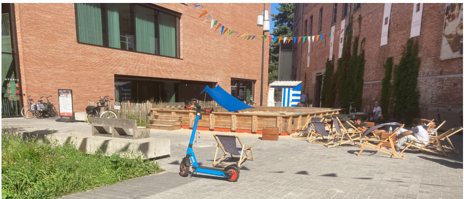
The seaside features