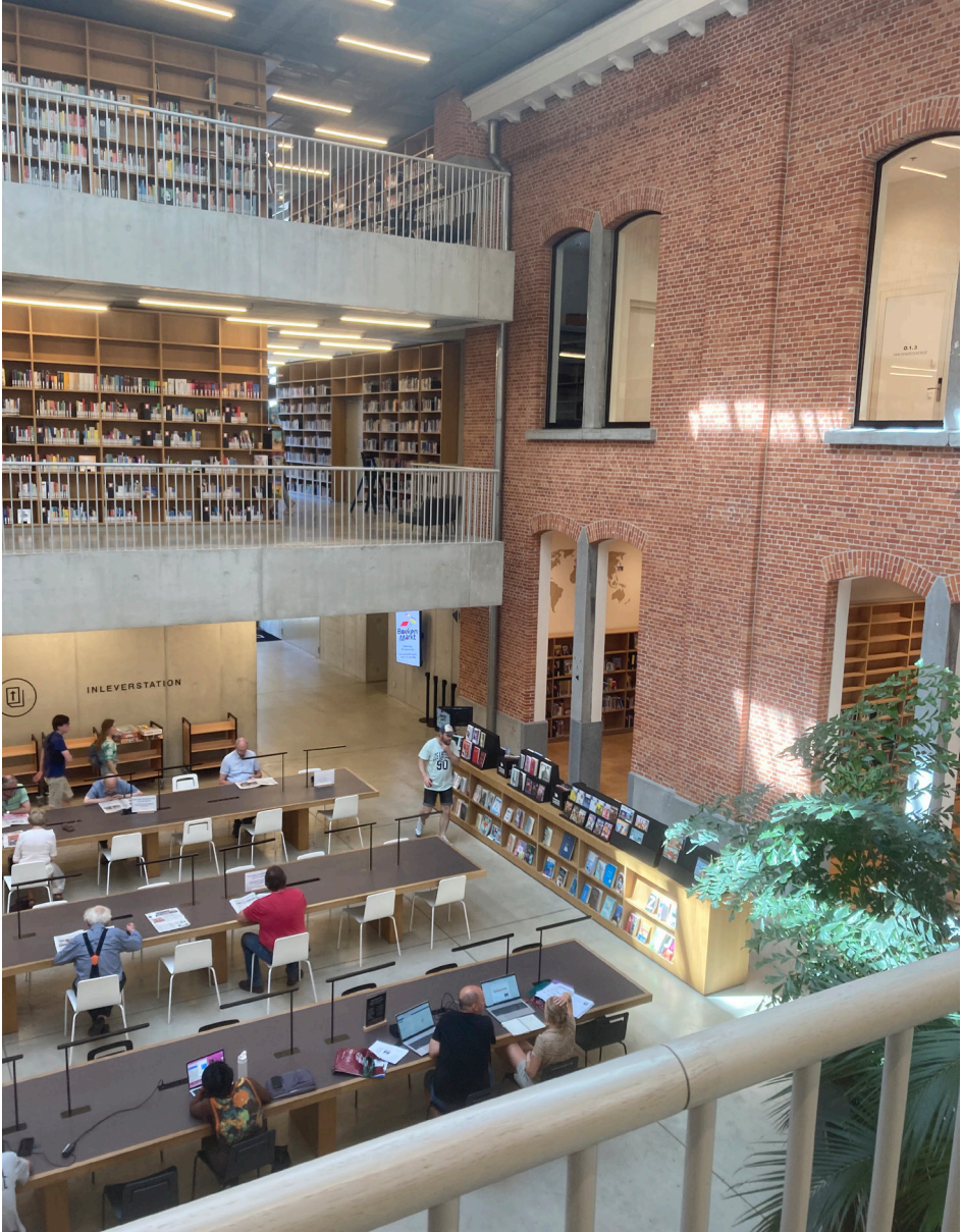
The mezzanines give a feeling of spaciousness