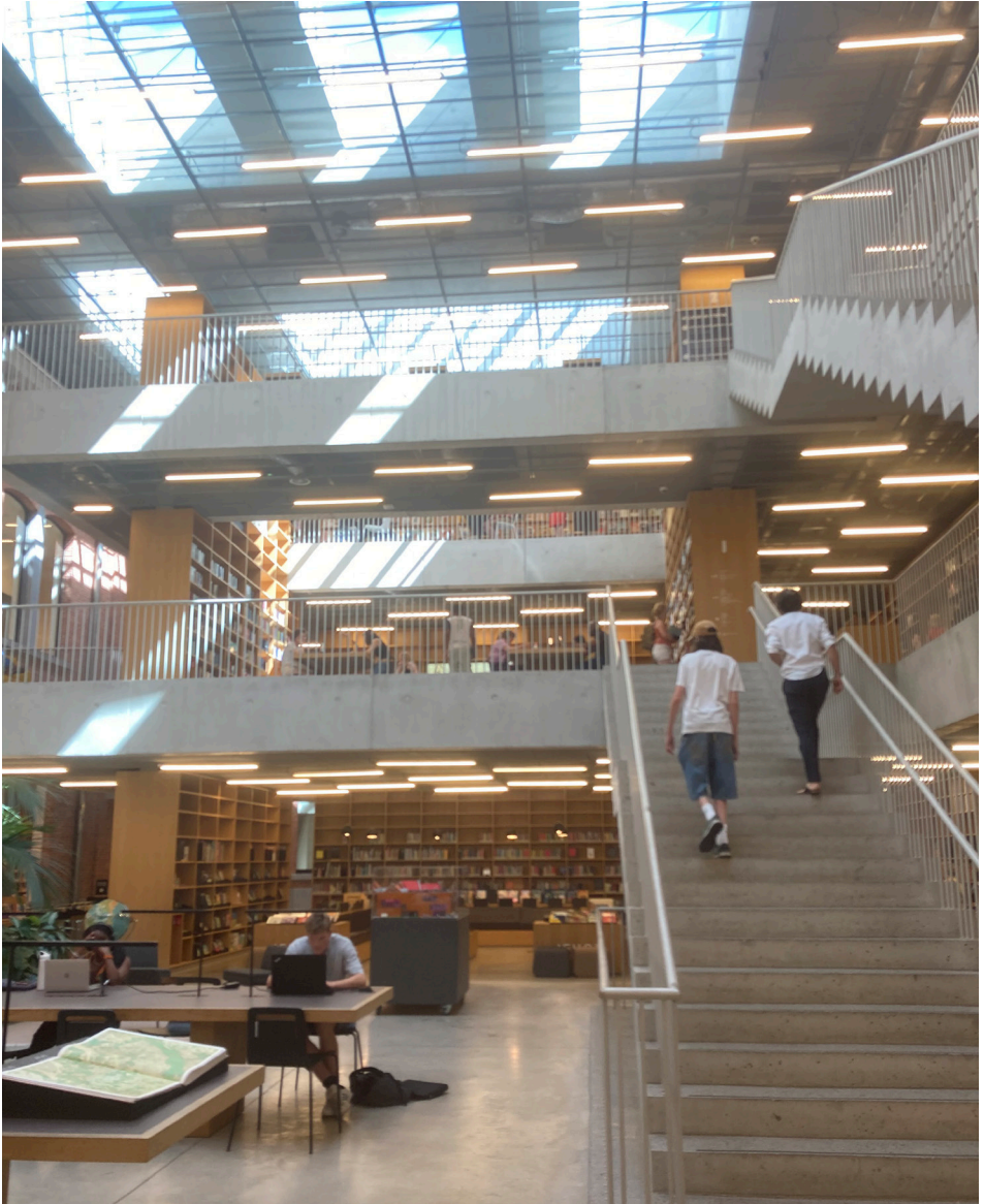
The spacious interior makes a feature of the stairs