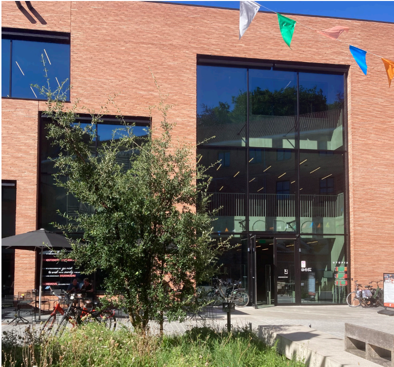
Large windows are a feature