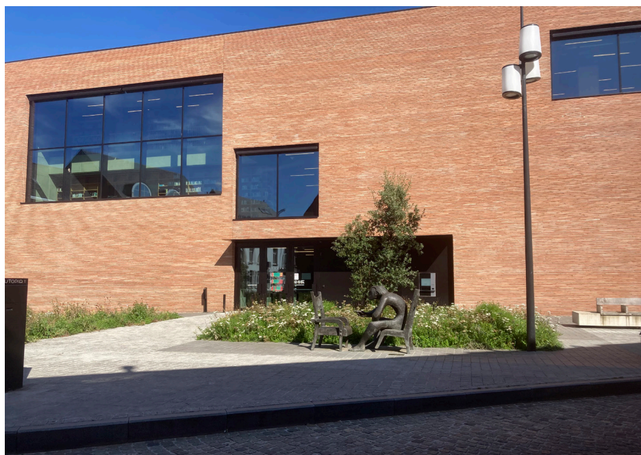
Aalst Library is built of Flanders bricks as seen by this view of the Front

That's the name dealt with, but why the buckets and spades? It's the library's way of bringing the seaside to an inland town during the school holiday. There is a great big sandpit, lots of deck chairs, an ice cream stall, and even some seagulls had taken the trouble to come inland.