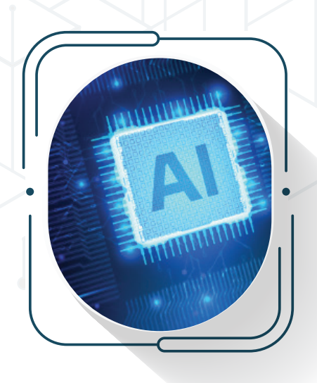
Generative AI Models