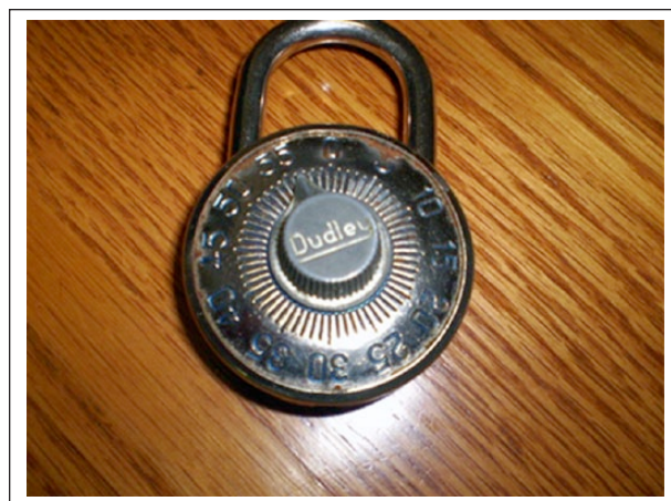
Figure 2. Locked (Submitted by Raj).

The interiority of suicidality also led to pressures to remedy the issue(s) from within. Talking about Figure 2, Raj detailed the challenges of finding the right combination of strategies to avoid suicide.