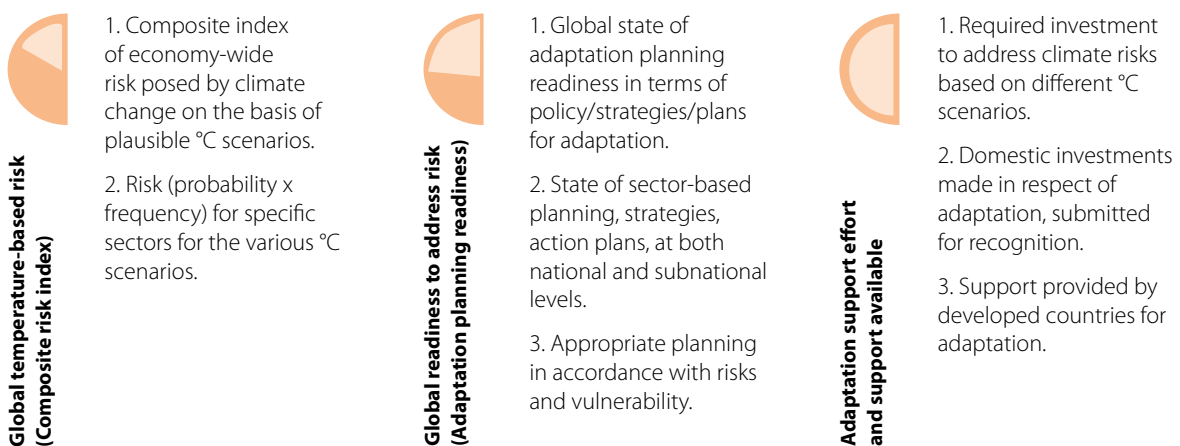
Figure 1. A framework for metrics to track implementation of the GGA

Further work is required to synthesise the various studies and approaches to reflect the required adaptation investments in light of different temperature scenarios. The a-INDC communicates the adaptation needs of developing countries and, as such, provides the most authoritative and nationally determined benchmark for required adaptation support,