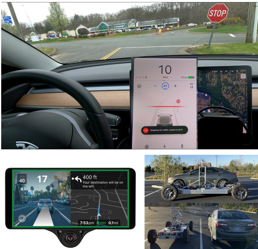
Figure 1. Resource from AS 2 Guard group (Tesla, OpenPilot, and AD Chassis)

To start the project, I would like to first learn the principles of the basic neural network models behind the perception and set up the environment such as different driving conditions. Then, I will follow the sequence of tasks described in project components. To perform the security analysis under different attacks, I would prepare myself with supplemental adversarial attack knowledge and comprehensively read related papers to gain a sense of what attack strategies are suitable to and have practical meaning to the existing DNN models. Specifically, I plan to try the lane detection attack [1] and stop sign attack [4] in OpenPilot Comma three [7], a real Tesla vehicle or an AD chassis shown in Fig. 1 (resource from AS 2 Guard research group). To analyze the robustness of a model, I will not only try to find an adversarial example, but also try another way to recognize whether every input produces a correct output.