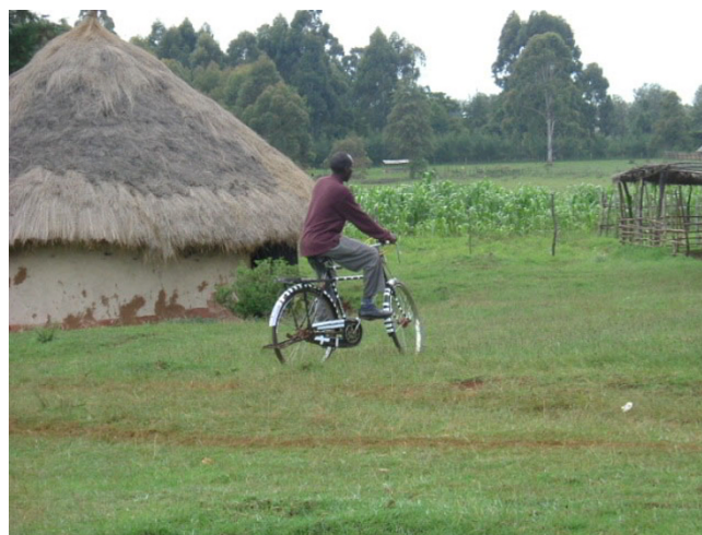
Figure 4 Research assistant arriving in a patient's village on a bicycle.

A research assistant used the PDA-based structured questionnaire to assess enrolled patients in the health center (following the clinical visit) on Day 1 and in the patients' homes on Days 7 and 30. Research assistants used bicycles as their primary means of transport to visit patients in their homes (Figures 4 and 5). During the follow-up visits the outcomes that were assessed included resolution of symptoms specific to acute respiratory tract infections, drugs taken, hospitalization, and time away from work or