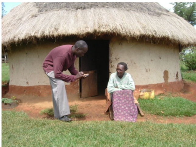
Figure 5 Research assistant collecting outcome data on a subject.

usual activities. At the end of each week, each research assistant uploaded data (by either infrared beaming of data or use of a cradle) from the PDA into a Microsoft Access database that was also created on a desktop micro-computer using Pendragon Forms. These data were then merged with data from the MMRS.