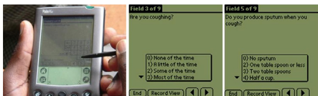
Figure 3 The programmed PDA and sample screens. A: PDA in use. B: Screen used to collect data on cough. C: Screen used to collect data on sputum production.

tobacco use and type of fuel used for cooking; physical signs such as wheezing, bronchial breathing, and crepitations; and chest X-ray results. In most cases, the examining clinician obtained and recorded a peak expiratory flow rate. These changes were integrated into the paper encounter forms and into the MMRS data entry module, the latter by adding checkboxes and dropdown lists on prior care sought, tobacco use, symptoms, physical signs, and laboratory results (Figure 2).