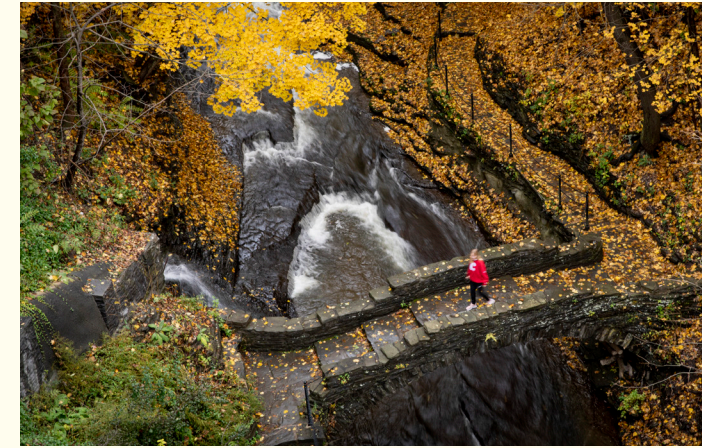
Cascadilla Gorge near Stewart Avenue

Tour Fall Creek Gorge, Cascadilla Gorge or around Beebe Lake with your mobile device. Download "Pocketsights Tour Guide" from the App Store or Google Play. Scroll to select your desired tour.