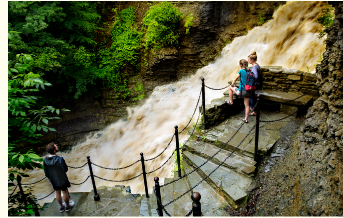
Eddy Dam Foot Bridge in Cascadilla Creek Gorge

Cover: College Avenue Stone Arch bridge over Cascadilla Creek.