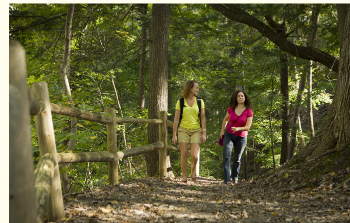
Fall Creek Gorge

If you need emergency assistance in a gorge, call 911 and reference the letters and numbers on the closest red emergency locator sign to help first responders locate you.