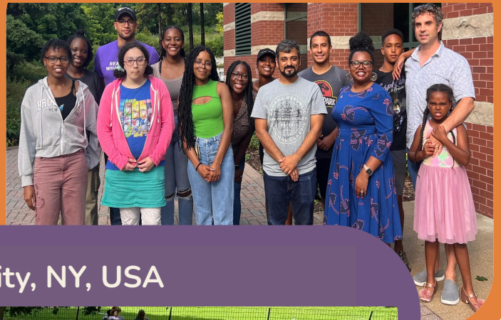
New York City, NY, USA