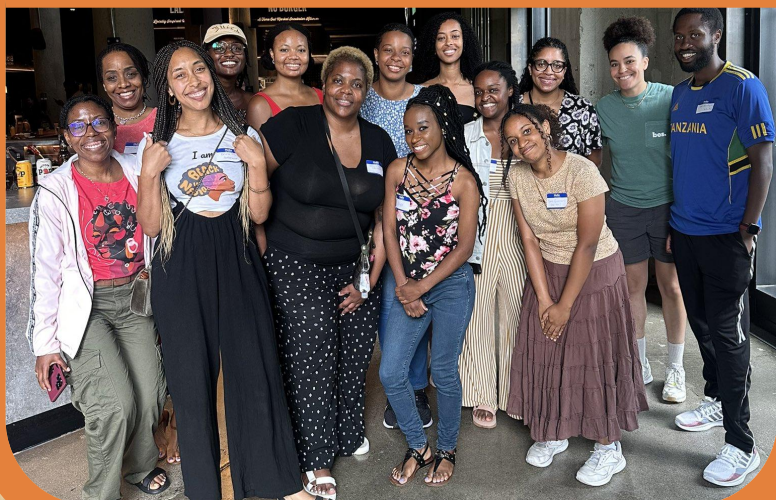
Boston, MA, USA