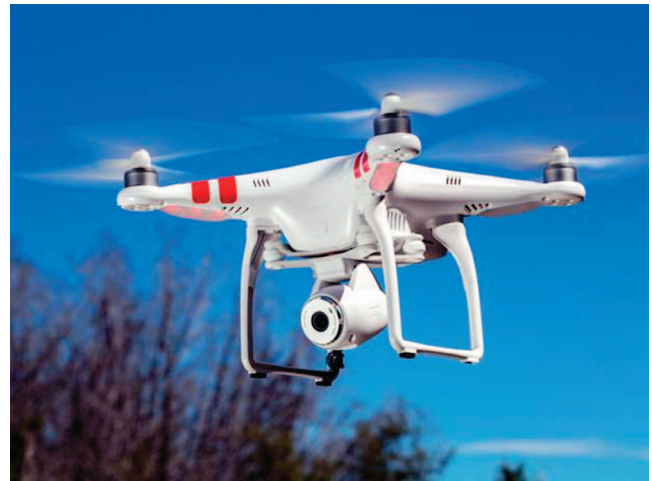
Figure 2. DJI Phantom 2 Vision Quadcopter with integrated camera.

Unmanned helicopters come in many different configurations. One popular, stable design is the quadcopter, a multi-rotor helicopter that is lifted and propelled by four rotors. Quadcopters use two sets of identical fixed-pitch propellers: two rotating clockwise and two counterclockwise. Control of