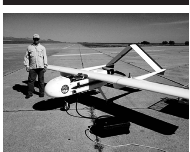
Figure 1. The Sensor Integrated Environmental Remote Research Aircraft (SIERRA) on the tarmac at NASA's Crows Landing Airport in California.

These SUAVs have advanced designs to carry small payloads and integrated flight control systems, giving them semiautonomous or fully autonomous flight capabilities. In autonomous UAVs, the acquisition of remote-sensing data is preprogrammed with flight planning software that can calculate waypoints for image acquisition based on the desired ground resolution, amount of image overlap, and area to be surveyed. Digital cameras are commonly part of the payload. During the flight, the UAV's autopilot can communicate via a telemetry link to a ground station running flight control software (Hugenholtz, 2012). For example, the AeroVironment RQ-14A "Dragon Eye" has a 110-cm wingspan and weighs about 2.5 kg. Launched by hand or with a bungee cord, the small plane is controlled by GPS coordinates entered into its guidance system with a standard laptop computer. Once aloft, it can transmit video images of the coastal landscape in real time (Edwards, 2009).