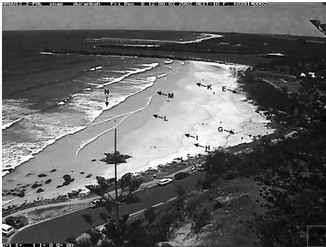
Figure 2. An example of a range of visibly discernible shoreline indicator features, Duranbah Beach, New South Wales, Australia. For key, see Figure 1.