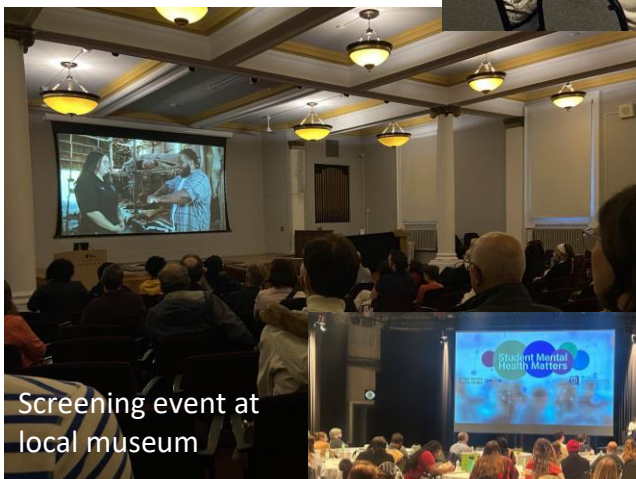
Screening event at local museum