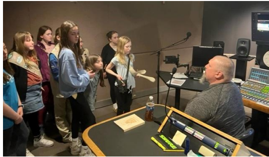
Student visits to studios