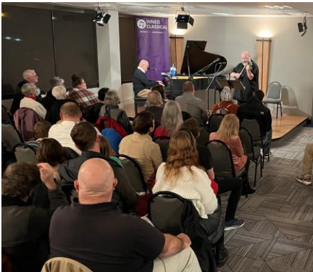
Free concerts in performance space