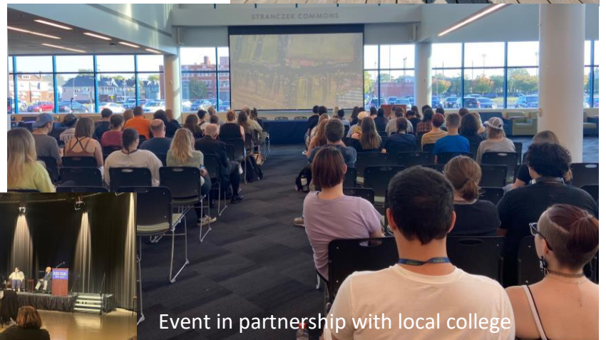
Event in partnership with local college