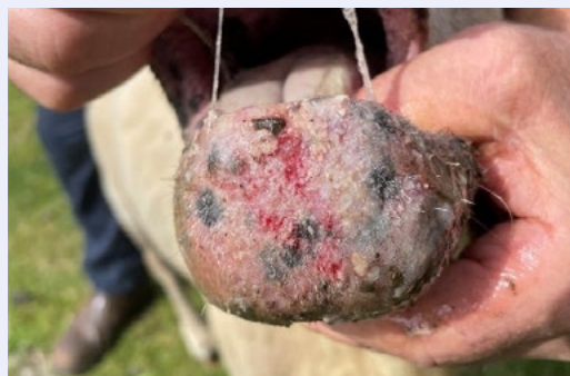
Ulcers and lesions in the mouth