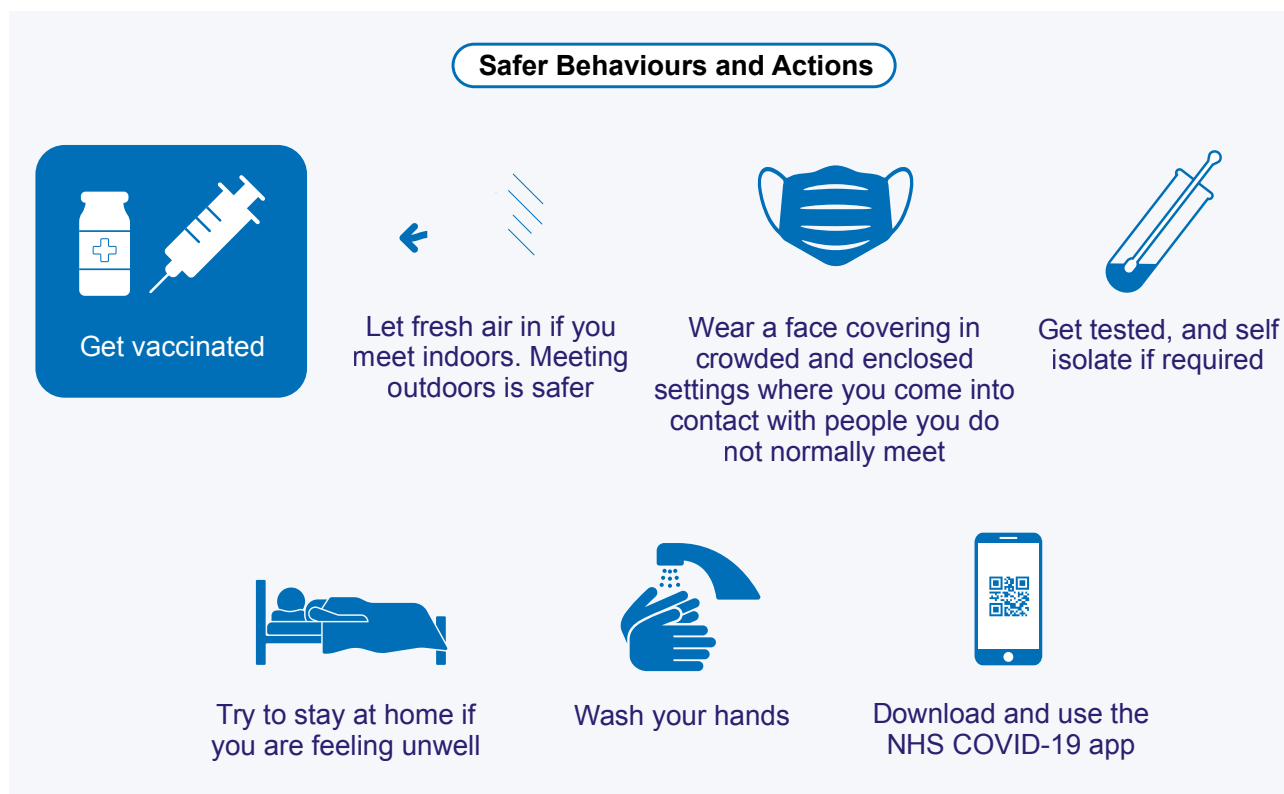
Figure 2: Safer Behaviours and Actions