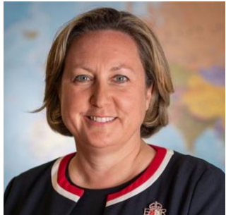
Anne-Marie Trevelyan MP Secretary of State for International Trade

"The UK will host this year's COP26 summit in Glasgow and we are determined to lead by example. Trade and Climate are closely interlinked, which is why we are proud that our award-winning export credit agency, UK Export Finance (UKEF) is launching its Climate Change Strategy to stimulate green exports. As the global economy recovers from the COVID pandemic, by supporting the UK's clean exporters, UKEF is at the heart of our plans to help build back cleaner and greener."