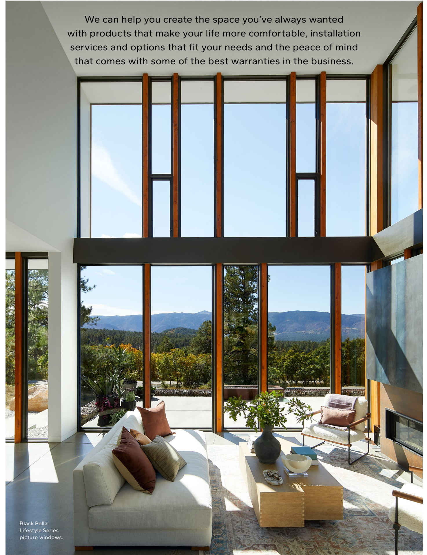
Black Pella Lifestyle Series picture windows.

We can help you create the space you've always wanted with products that make your life more comfortable, installation services and options that fit your needs and the peace of mind that comes with some of the best warranties in the business.