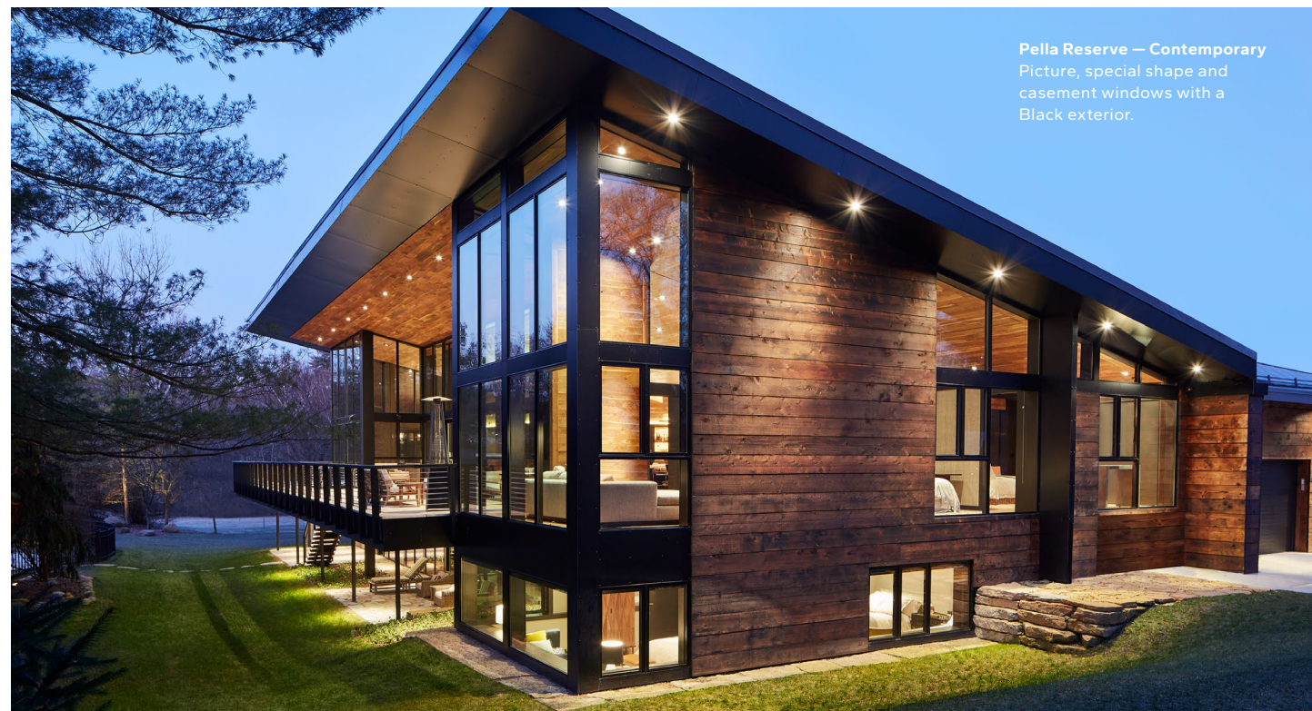
Pella Reserve — Contemporary Picture, special shape and casement windows with a Black exterior.

You can feel confident in your investment. We pride ourselves on providing exceptional quality, exceeding expectations and going beyond requirements. That's why we stand behind our windows and patio doors with a limited lifetime warranty. 2