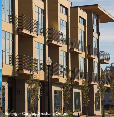
Beranger Condos, Gresham, Oregon

“When we choose windows, we look at energy efficiency, cost-effectiveness and added value. With Pella, we get it all – plus quality, name recognition and outstanding support.”