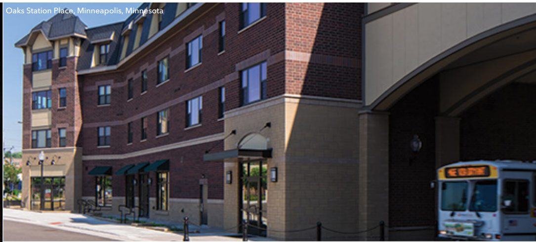
Oaks Station Place, Minneapolis, Minnesota