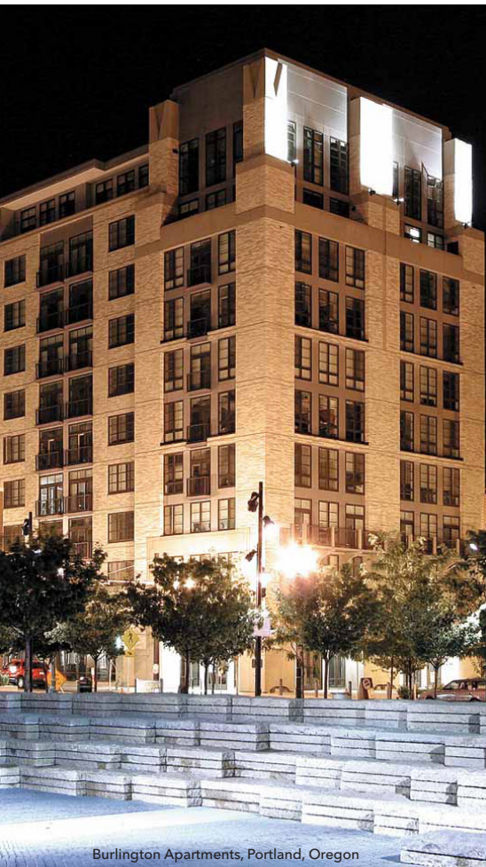
Burlington Apartments, Portland, Oregon

Featuring Window and Door Solutions from Pella