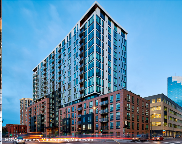
HQ Apartments, Minneapolis, Minnesota