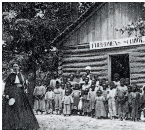
Across the South, blacks of all ages flocked to freedmen’s schools.

Southern states passed laws called Black Codes to limit black people’s freedom. For example, black people could be fined or jailed