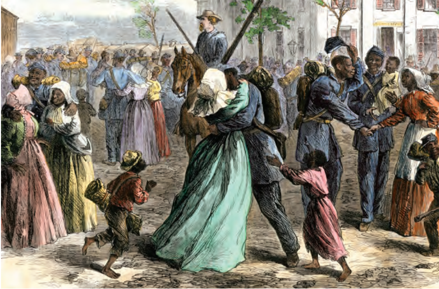
Black soldiers returning home at the end of the Civil War

The period just after the Civil War, when Addy's mystery takes place, was a time of enormous hope and optimism for black people in America.