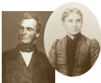
Two black Abolitionist leaders in Philadelphia, Robert Purvis and Charlotte Forten

Black people had fought hard to end slavery. In the decades before the Civil War, leaders of the anti-slavery movement, called Abolition , included educated, eloquent free blacks, such as Frederick Douglass. After the war broke out, tens of thousands of black men like Addy's brother, Sam, enlisted as Union soldiers. Other black men and women supported the Union cause just as bravely but in secret—as spies. Black spies were so important, in fact, that Confederate General Robert E. Lee wrote in frustration, "The chief source of information to the enemy is through our negroes."