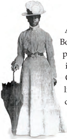
Mary E. Bowser

Another daring spy was Mary Elizabeth Bowser, an educated former slave with a photographic memory. Pretending to be illiterate, she became a servant in the Confederate White House, where she listened to President Jefferson Davis's conversations and read his letters. The information she provided to the Union was so crucial, and her position in Davis's home so dangerous, that she is now included in the U.S. Army's Military Intelligence Corps Hall of Fame.