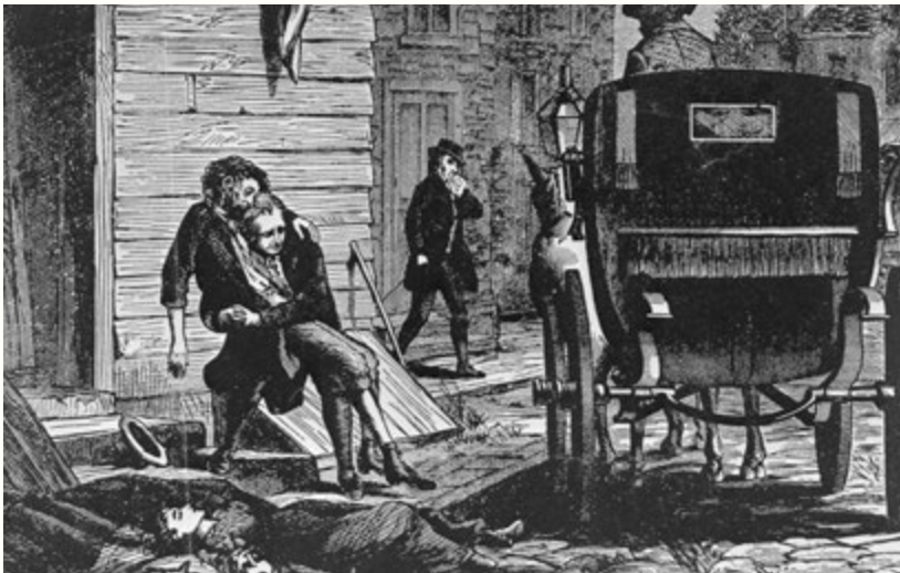
When yellow fever struck Philadelphia in 1793, carriages rolled through the streets night and day to collect the dead and dying.

All of America's cities suffered epidemics. In 1793, Philadelphia—then the nation's capital—was struck by a yellow fever epidemic that killed 5,000 and forced George Washington and Thomas Jefferson to flee. In 1832, a deadly cholera epidemic brought New York City to a standstill and then swept on to Boston, Cincinnati, Philadelphia, and Baltimore. In 1918, more than 500,000 people across the country died in a flu epidemic.