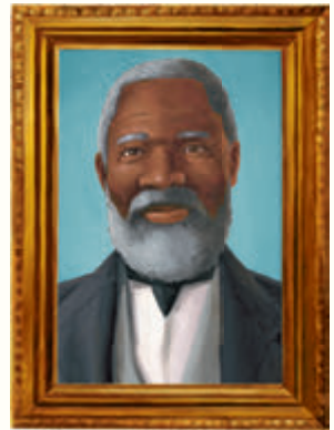
G R A N D - P È R E Cécile's loving grandfather, a retired sailor with many tales to tell