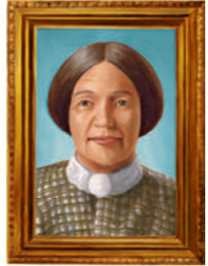
MRS. CURTIS A no-nonsense widow who is the Gardners' housekeeper