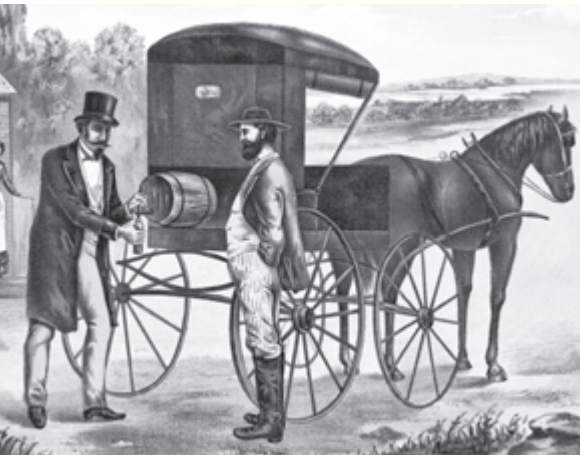
A traveling doctor selling homemade medicine

patent medicines were kept secret. They were usually made from herbs, and most of them contained a great