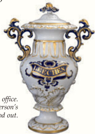
Marie-Grace's father kept a jar of leeches in his office. Physicians like Dr. Gardner would place a leech on a person's skin and let the wormlike creature suck the blood out.

When people got sick, the treatment sometimes made them worse instead of better. Bleeding, for example, was believed to release the "bad blood" that contained disease. Doctors opened a patient's vein to drain some of the blood. Since the instruments were not sterile , or clean, patients could develop infections and get even sicker. Some patients lost so much blood that they fainted. Many doctors believed that bleeding was an effective cure. They used it to treat everything from a serious fever to a bruise from a fall.