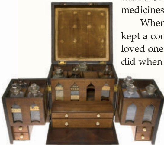
Doctors took boxes or bags of supplies when they went on house calls.

When sickness struck, families kept a constant watch over their loved ones—just as Marie-Grace did when Mademoiselle Océane