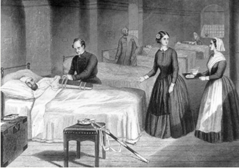
Florence Nightingale was a nurse in England in 1853. Her ideas about hygiene and sanitation greatly influenced American nursing.

fell ill. Friends and neighbors took turns staying throughout the night so that family members could rest. Such compassion was also extended to strangers. When a Boston merchant traveling through Worcester, Massachusetts, became seriously ill, a lawyer whom he had known for only a day took over his care. The lawyer spent more than a week nursing the sick stranger until he was well enough to go home.