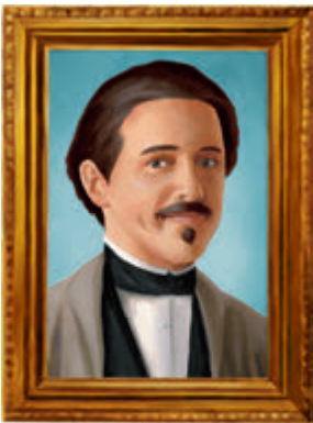
UNCLE LUC Marie-Grace's uncle, who is a Mississippi River steamboat pilot