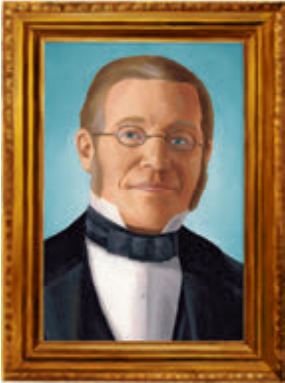
PAPA Marie-Grace's father, a dedicated doctor who is serious but kind