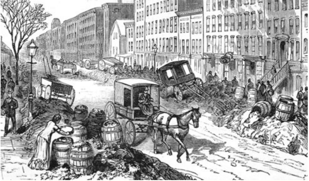
Garbage collection was limited in most American cities throughout the 1800s. People threw their trash into the streets, and that's usually where it stayed.

When Marie-Grace was growing up, America was not a healthy place to live. People often consumed food and water that were not safe. There were no refrigerators to prevent harmful bacteria from growing, so food spoiled quickly. Drinking water usually came from the same rivers that were used as dumping grounds for garbage and human waste. Trash and horse droppings littered city streets.