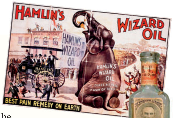
Advertisements for patent medicines and the labels on the bottles promised fast relief for all sorts of ailments.

deal of alcohol. Some medicines even included deadly substances such as turpentine and kerosene. Unlike today, the makers of these medicines did not have to prove that their tonics were effective or even safe. One store in Topeka, Kansas, displayed a sign that read, “We sell patent medicines but do not recommend them.”