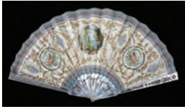
A lady's fancy fan

rich, deliciously seasoned foods; and the lively social scene, full of parties, balls, opera, theater, and horse races, even on Sundays.