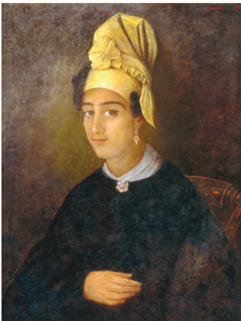
Wearing a turban or head wrap called a tignon (tee-yohn) was a stylish way to show pride in being a woman of color. The custom grew out of a time when women of color in Louisiana had been required to wear head scarves.

New Orleans' free people of color took pride in their unique identity. Public squares in certain neighborhoods—especially Congo Square in the Tremé neighborhood—became gathering places where people of color socialized and where musicians and dancers performed in the