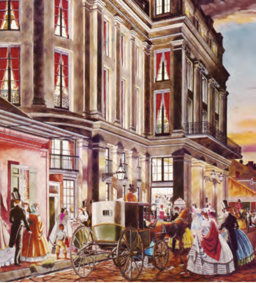
Ladies and gentlemen arriving for an elegant evening at the French Opera House in New Orleans.

ballrooms, but the surroundings were equally luxurious.