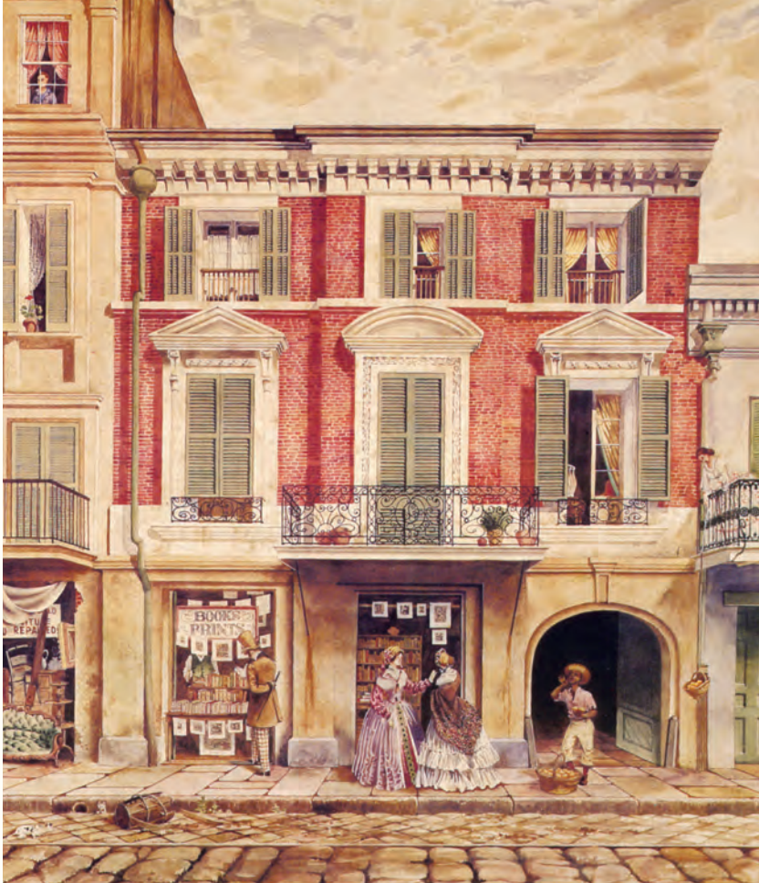
A street in the heart of New Orleans around 1850. To most visitors, the city looked and sounded more French than American.

In 1853, when Cécile's story takes place, Louisiana had been part of the United States for fifty years. Yet New Orleans, Louisiana's biggest city, was remarkably different from any other city in America. Visitors from other states noticed the differences immediately: the sound of French being spoken in streets and shops; the