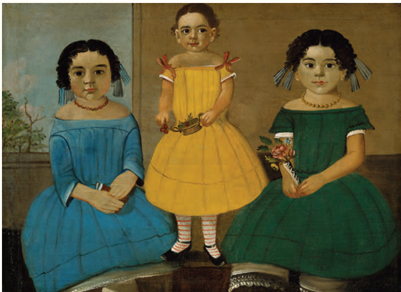
Free girls of color in 1854

For much of the early nineteenth century, New Orleans stood out as a place where people of color enjoyed more freedoms than anywhere else in America.