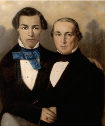
This painting from about 1845 reflects the close relationship between the young man of color, on the left, and a white relative.

elegant society. Many well-to-do children of color were tutored privately or even sent abroad to study, as Cécile's brother, Armand, was. New Orleans' free people of color were not treated equally with whites, but they had more freedom and opportunity than black people anywhere else in the United States.