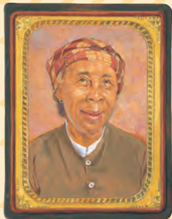
AUNTIE LULA The cook on the plantation, who is like family to Addy