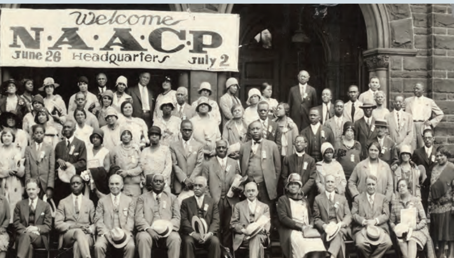
In 1929, the NAACP celebrated its twentieth anniversary at a meeting in Cleveland, Ohio.

for the Advancement of Colored People (NAACP). Created in 1909, the NAACP created a youth council in 1936 so that children like Addy could learn about their civil rights and take active roles in fighting segregation and discrimination.