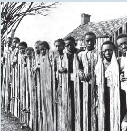
Segregation made life difficult for African Americans.

Even so, the lives of most black people did not improve very much after the Civil War. Many white people in the South disagreed with Reconstruction. They were angry that they were no longer allowed to have slaves and that men who had been slaves could now vote. So Southern states passed laws called Black Codes that forced African Americans to work for low wages and made it hard for them to buy land. Southern states also passed laws to segregate, or separate, black people from white people. These laws forced black people to use separate areas in restaurants, hotels, and other public places or to use entirely separate buildings.