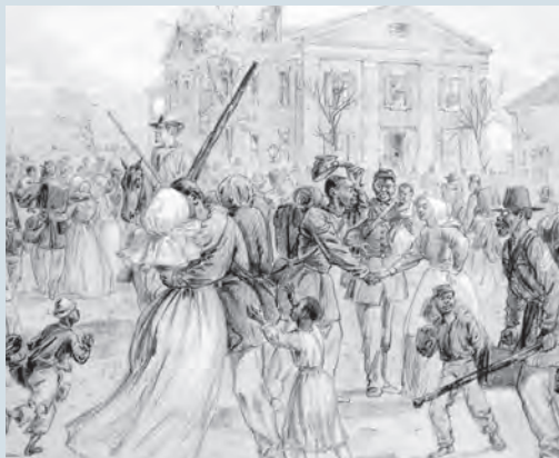
Friends and family welcomed black Union soldiers home from the war.

In 1865, the Civil War ended after four terrible years. Soldiers hurried home to their loved ones. Newly freed slaves returned to the plantations where they'd last seen their parents, children, and spouses. Families separated by slavery and by war began to be reunited, just as the North and South were joining together again as one nation.