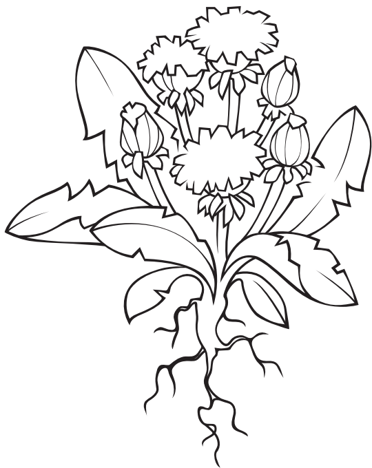
Dandelions stimulate digestion and are full of vitamins and minerals