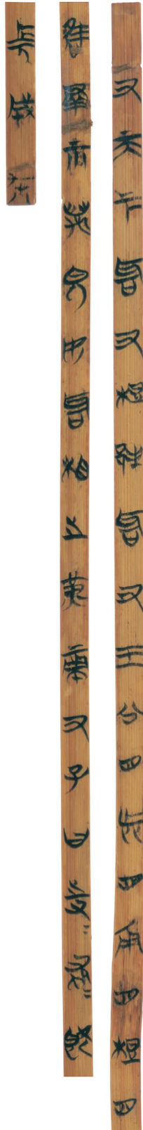
Figure 2: An example of a CBS material. The slip shown is the 98th slip of the “Wu Ji” from Tsinghua University Slips.