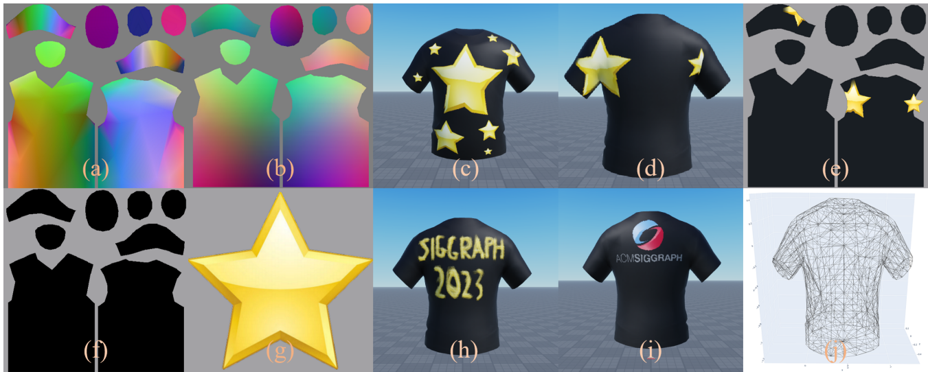
Figure 1: (a) Local Space Positional Map. (b) Local Space Normal Map. (c) Stamping with different projector transform (d) Stamping vs Projection Result. (e) Stamping vs Projection in Texture. (f) Target Texture. (g) Decal Texture. (h) SIGGRAPH Hand Painting using proposed technique. (i) SIGGRAPH Logo as Decal (j) Model Mesh.

Faraz Baghernezhad Roblox USA fbaghernezhad@roblox.com