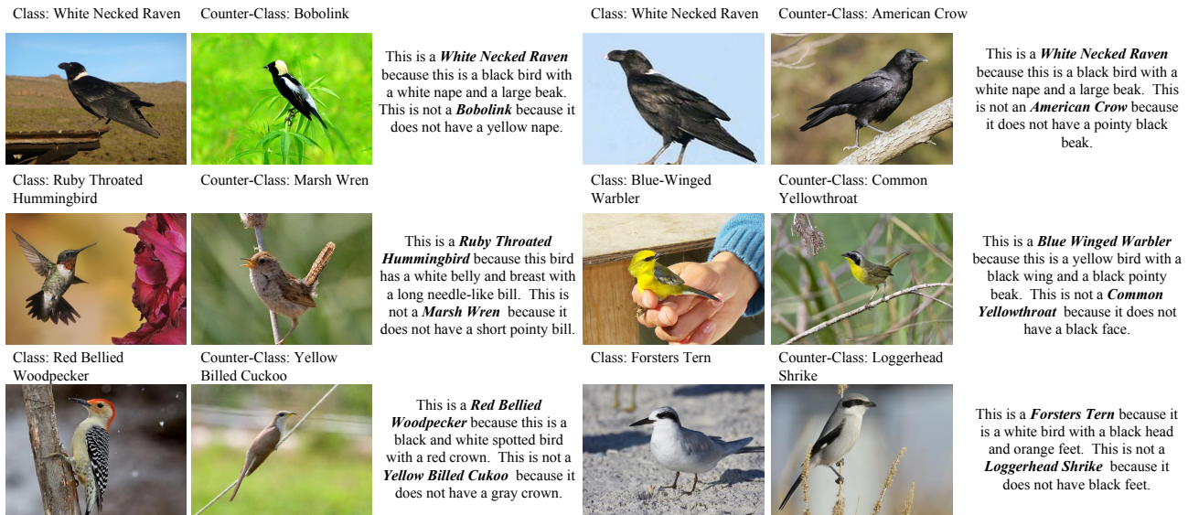
Figure 2. Qualitative examples of counterfactual explanations. Image on the left, with example image from counter-class on the right. We show the explanation from (Hendricks et al., 2016) followed by our generated counterfactual explanation.

be applied to the example bird from the counter-class “Common Yellowthroat”. However, when including the counterfactual explanation generated by the method described in this work (“This is not a Common Yellowthroat because it does not have a black face.”), it is immediately clear that the bird on the left must be a “Blue-Winged Warbler” and the bird on the right is a “Common Yellowthroat.” Yellow faces on yellow birds are common, so it is likely that models which just discuss discriminative features in an image do not learn to mention yellow faces on yellow birds. In this case, the absence of a feature (“black face”) is helpful when explaining the bird category.