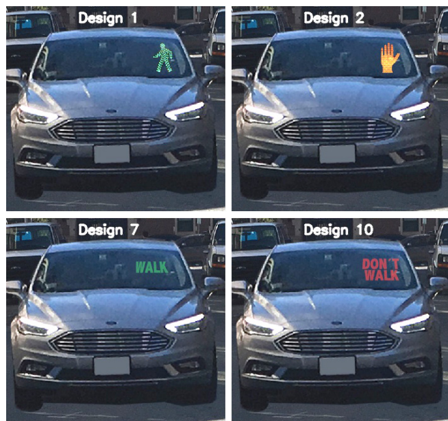
Figure 2: Four of the designs tested (out of 30 total in Fig. 3) shown in cropped, close-up views. Presentation to participants used the entire image shown in Fig. 1 at a 1280 pixels wide and 720 pixels tall resolution. These 4 designs performed significantly better than the other 26 at communicating their intent as shown in Fig. 4.

is provided as supplementary material. The size of the stimuli presented to each Turker was 1280 pixels wide and 720 pixels tall. Turkers with screen resolutions below this size were automatically detected and could not participate in the experiment.