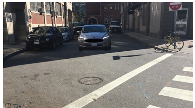
Figure 1: The driver was not visible in the base image used to create the designs due to lighting and reflection angles.

The base photograph used to create the stimuli (see Fig. 1) was of a late model passenger sedan on a one-way urban street approaching an uncontrolled intersection/crosswalk (no traffic light). Under the lighting conditions the driver is not visible.