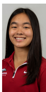
KALYXTA GAMAIO AA | FR | 4-10