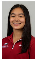
KALYXTA GAMAI0 AA | FR | 4-10