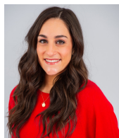
JORDYN WIEBER HEAD COACH