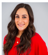
JORDYN WIEBER HEAD COACH