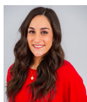
JORDYN WIEBER HEAD COACH