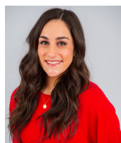
JORDYN WIEBER HEAD COACH